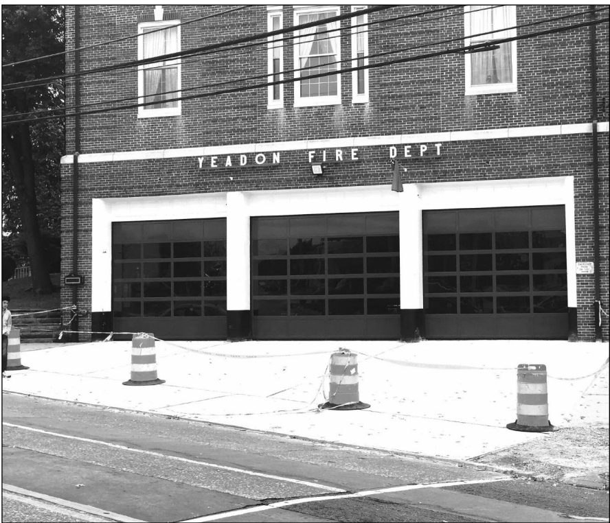
Left and Top photos: Work in-progress at the fire station. Bottom photo: The new concrete slab and sidewalk are allowed to cure before being returned to regular use.