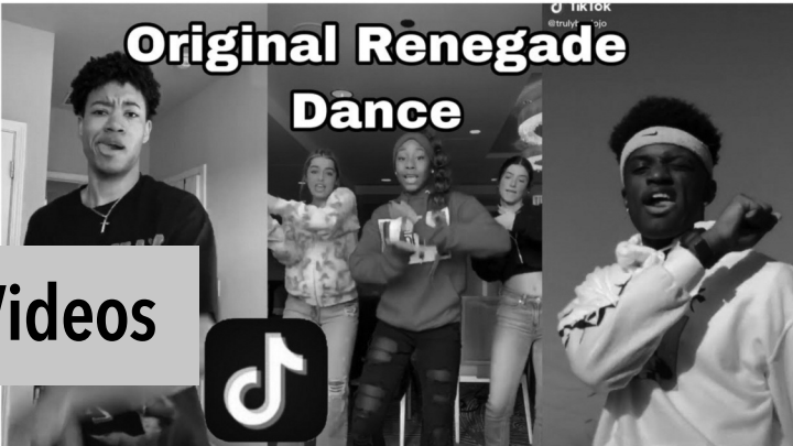
Tik Tok Videos

Most folks were unable to work, go to school, or travel. So, what is the next best thing to do at home with a lot of time on our hands? Bake! Specifically, Sourdough bread, which is said to be one of the easier breads to make.