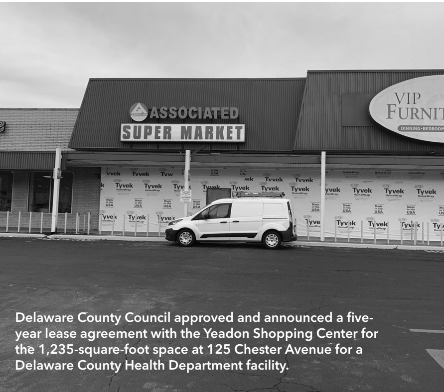
Delaware County Council approved and announced a five-year lease agreement with the Yeadon Shopping Center for the 1,235-square-foot space at 125 Chester Avenue for a Delaware County Health Department facility.