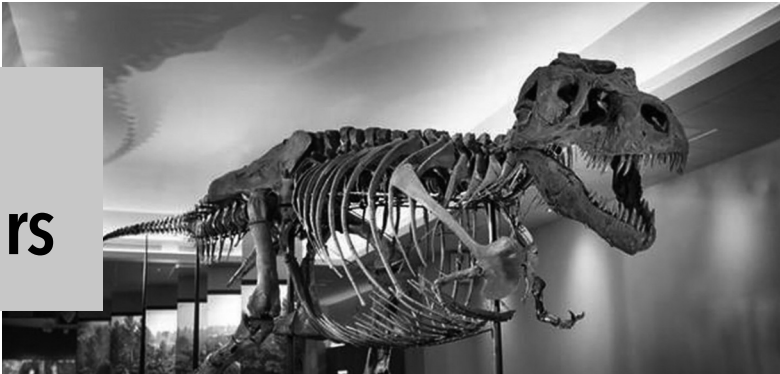
Virtual Museum Tours

Virtual tours made it possible for us to visit a museum, the zoo, or even an open house for sale.