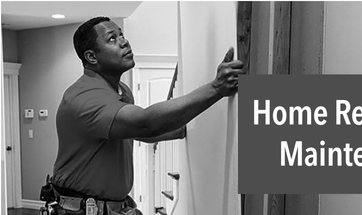
Home Repair and Maintenance

Tik Tok became so famous the U.S. President tried to ban it.