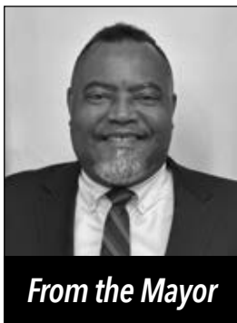
From the Mayor

So, it was with great pomp and pride that many